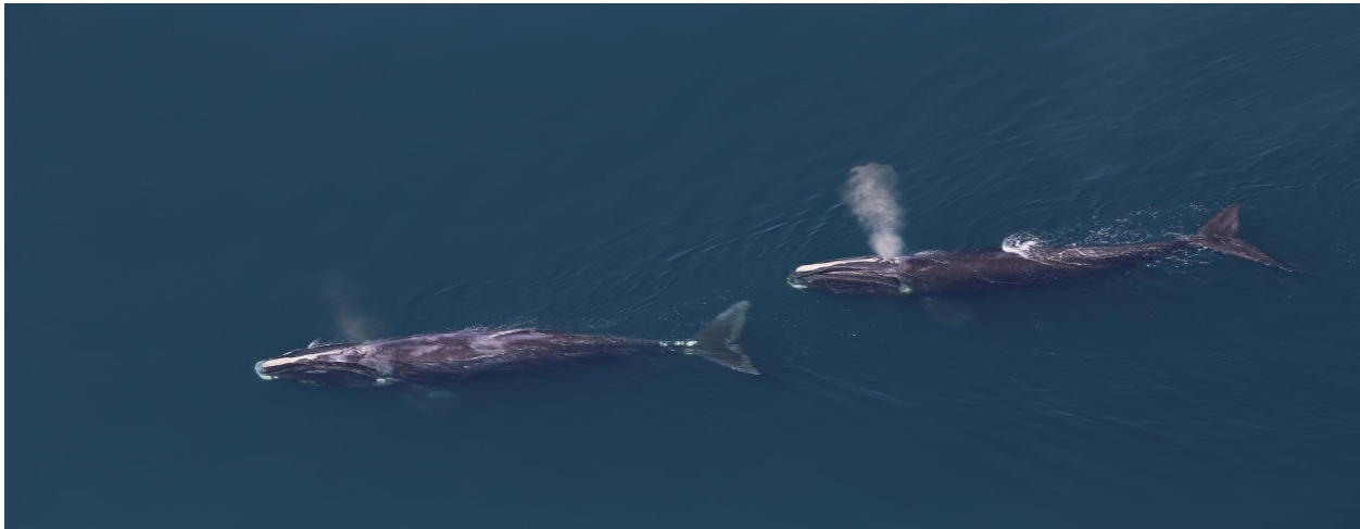
North American Right Whale