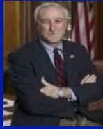
Honorable Sean O'Keefe