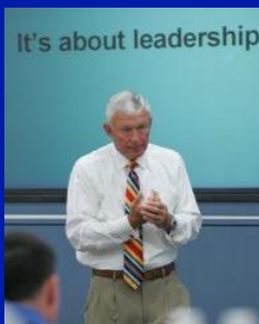
General Ed Eberhart

with respect to global challenges. Course participants share the interactive NSS learning model with colleagues having diverse backgrounds and experiences.