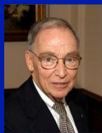
Honorable George C. Wortley

National Security Studies educates those who want to serve the nation so as to make a difference