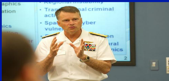
Admiral James Winnefeld