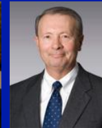
Admiral Edmund Giambastiani