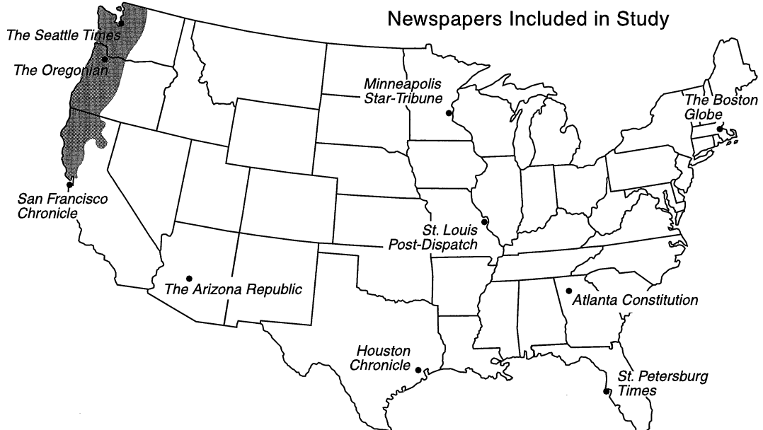
Figure 2. Distribution of newspapers analyzed for this study.

Pro-save themes included inherent limits to how long logging could continue even without