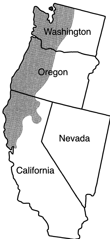
Figure 1. The range of the northern spotted owl (after Thomas et al. 1990).

This reliance on old-growth conifer stands has put the spotted owl at risk. Because they contain many large, old trees, these are exactly the stands that are most profitable to log. By 1989, owl habitat had been reduced an estimated sixty percent from 1800 levels (Thomas et al. 1990), mostly due to logging, and mainly in the twentieth century. A further threat to the owl is the fact that much of the remaining old-growth is highly fragmented (i.e., interspersed with logged stands), and such fragmentation may disrupt both the owl's social structure and the occurrence of its prey (Carey et al. 1992; Lamberson et al. 1992; Miller et al. 1997; but see Rosenberg et al. 1994 and Carey 1995 for dispute regarding the reasons for the owl's old-growth requirement).