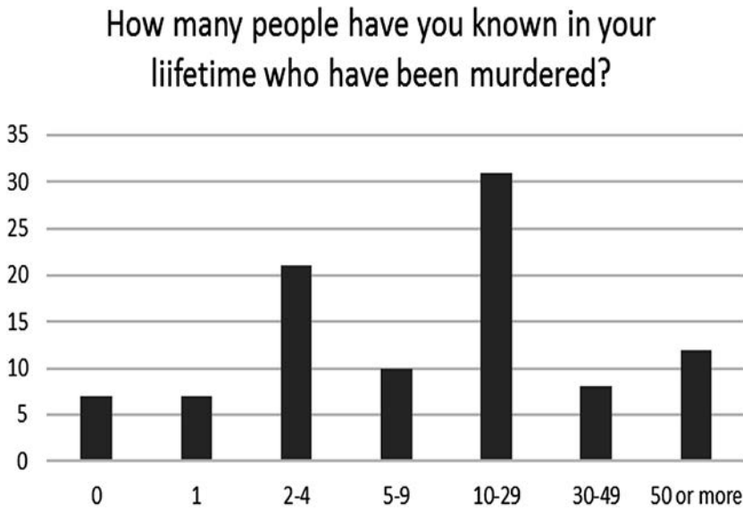
Figure 2. Total number of murdered individuals known to survey respondents.

were not able to give precise numbers, responding instead, “too many to count.” Only seven knew no murdered individuals. The graph above shows the responses to that question.